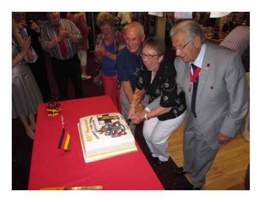
Pic 2: MGV: Cutting the 40 Years cake